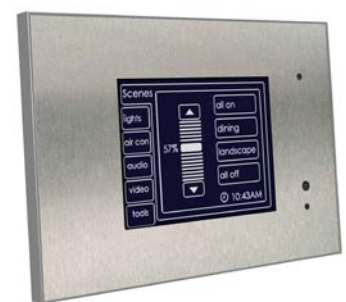
The new C-Bus MK2 comes in reflective (above) and non-reflective.

The new Touch Screen is available with or without a powerful logic engine for control switching and dimming loads, scenes, and schedules.