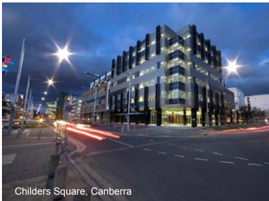
Childers Square, Canberra

The Childers Square building has been designed to achieve 4.5 Star NABERS and 5 Star, Green Star environmental ratings and encompasses many environmentally sustainable design initiatives including a grey water harvesting and re-use system. CTI was contracted to provide the electrical energy management system which included a flexible DALI lighting control system, integrated HVAC, emergency lighting, blinds and louvers and meters. CTI's solution provides a scalable and modular system designed for future system expansion within the building.